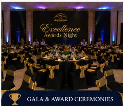
GALA & AWARD CEREMONIES