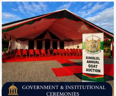
GOVERNMENT & INSTITUTIONAL CEREMONIES