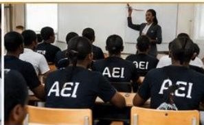
YOUTH TRAINING & MENTORSHIP