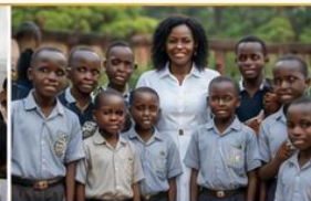
SCHOOL SUPPORT INITIATIVES